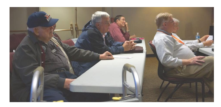
The presentation certainly captured these members attention.