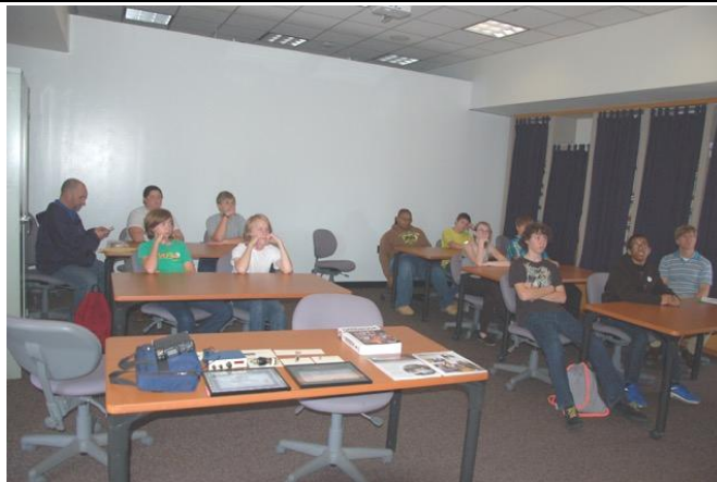
K4CGY's display table and a rapt audience.

We had a great time, and we appear to have interested some young folks. Two students on one of our groups are planning to launch a weather balloon and have requested our help with tracking the flight.