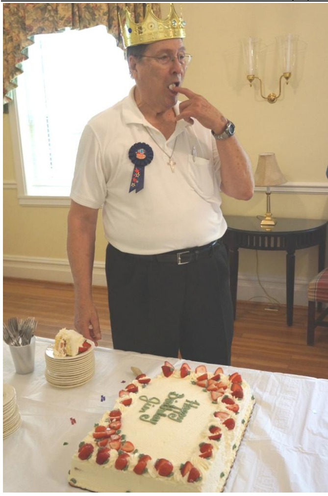
They even allowed me to cut the cake and sample the goodie.