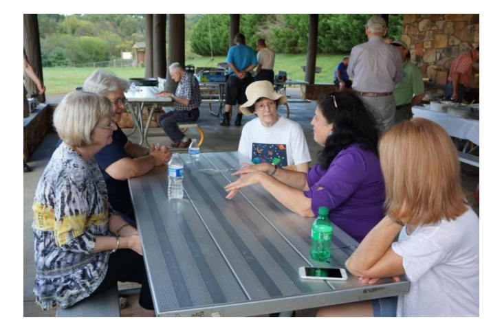
An XYL meeting was a part of the fellowship.