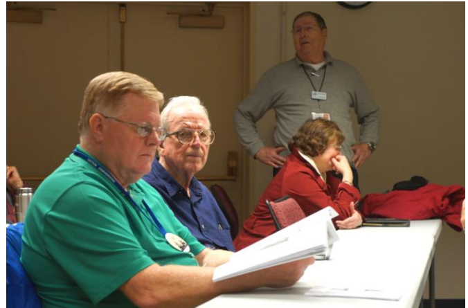
A business discussion during our last meeting.

Please consider serving the club as an elected officer by contacting a member of the nominating committee to express your own desire to run or maybe suggest a potential candidate.