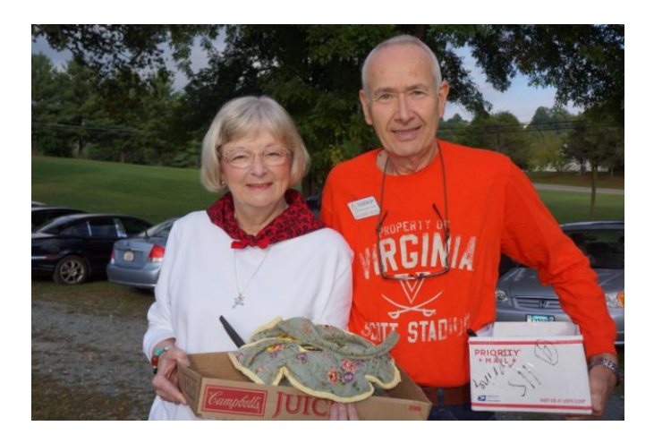
Eager picnickers showed up with food and goodies to sell in the auction.