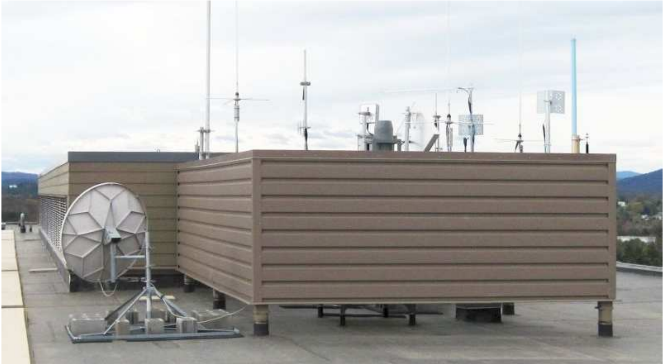
The antenna farm atop the Martha Jefferson Hospital that we have to compete with for space and interference from other services there.