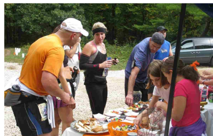
Check out the goodies at the typical rest stop.

The club will meet on November 13 at 7:30 pm at the National Radio Astronomy Observatory, 520 Edgemont Road, Charlottesville. This meeting is the meeting the Bylaws state that a Nominating Committee is to be named to fill a slate of officers and directors for 2013.