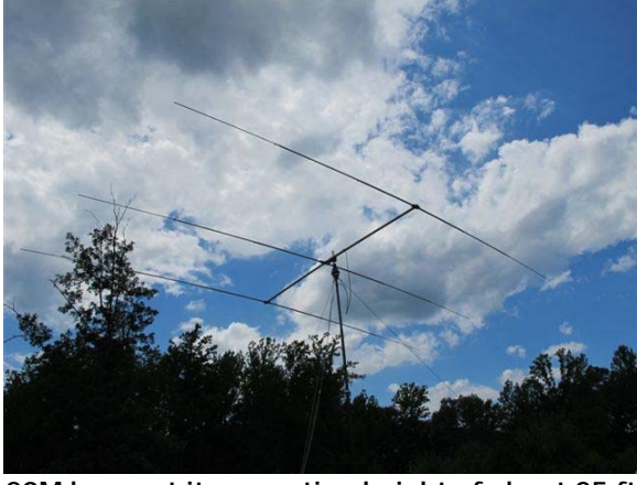
20M beam at its operating height of about 25 ft

By 5PM Friday most of the antenna work had been completed. Saturday morning, about 10AM, equipment installation was started. Generators were put in place and the shelter, mast and antenna for the 6m station was completed. Digital network was set up and after some problems looked to be working correctly. After a refreshing lunch it was time to get ready for the operating portion of field day.