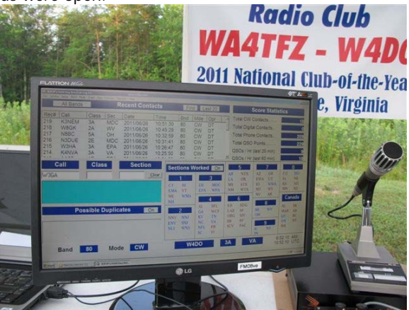
N3FJP logging software

The first 20 minutes or so went without a hitch and then the digital network decided to die. Trouble shooting proved that we had a problem that couldn't seem to be solved quickly so we went to single station logging. There was heavy activity on all bands and the different operators had a great time working all they could hear. Before the contest I had quickly installed a 10 and 15 meter dipole between two light standards just in case we needed to work other bands if the bands were open.