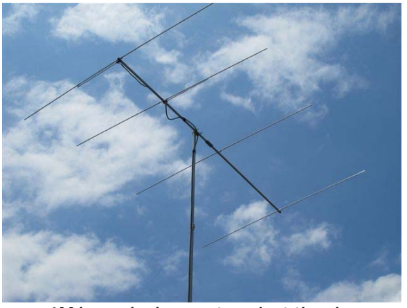
6M beam looks great against the sky