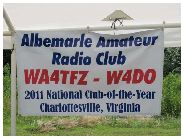
New AARC banner

The AARC operated Field Day 2011 at the Earlysville Fire Department again this year. Field day is arguably the ARRL's most popular operating event of the year, and definitely my favorite. Field day has something for every interest. Whether it's exercising your ideas for a new antenna type, trying out a new mode, honing your skills in CW, or digital, or just helping out by assisting others in erecting shelters, antennas, or any number of the myriad tasks necessary to erect 3 HF stations and a VHF station in a limited amount of time.