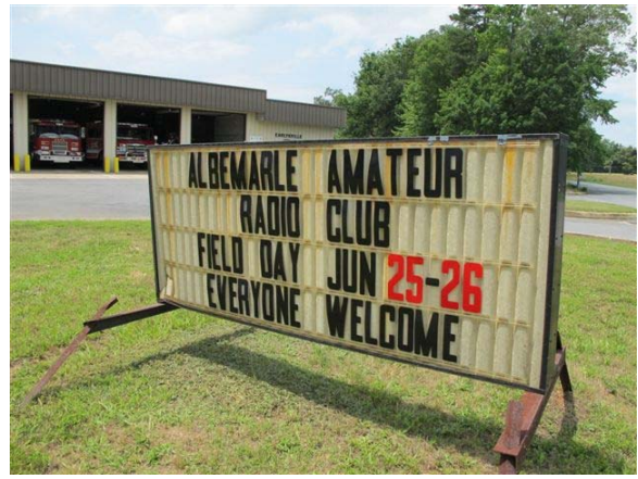
Earlysville Fire Station, Home to AARC FD

Field Day 2011. Perfect weather, good propagation, good friends, fellowship, opportunities to enhance your operating skills, good food, radios, fresh blackberries while putting up wire antennas, teamwork, these are just a few of the memories I have from Field Day 2011.