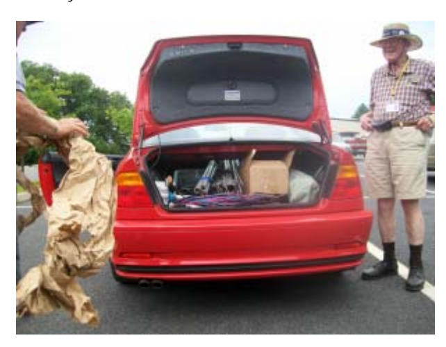
K8RVR was heard to remark "Holy !!!!. Is that some kind of clown car?"