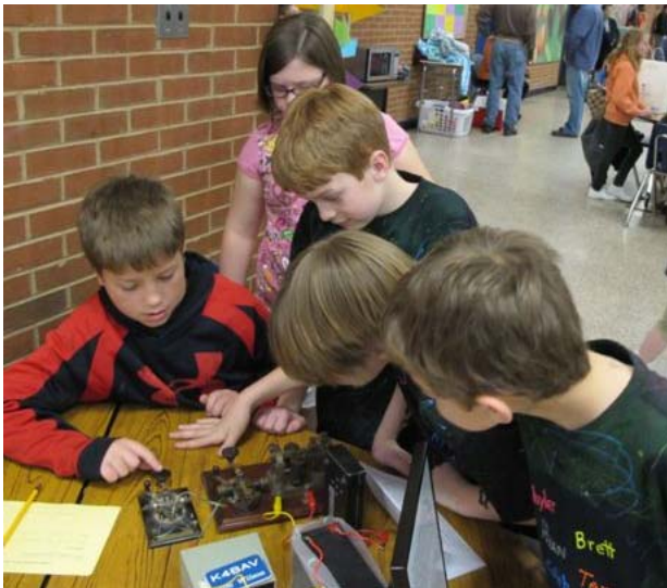
Who knew? Kids may really like CW

Event officials thanked us profusely for making the effort to come out.