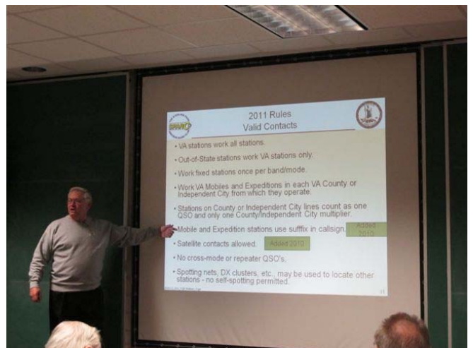
VA QSO Party Rules Review

The VA QSO Party has sponsored plaques for many operating categories (24 total), and offers a certificate to every participant that submits a log.