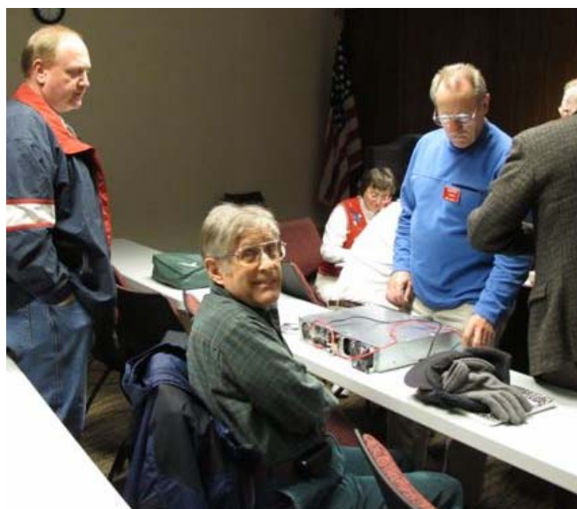
The new Vertex Repeater gets a once over