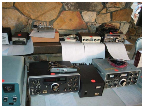
So Many Goodies

For more Picnic and Auction pictures, go to the AARC website photo gallery at: http://www.albemarleradio.org/gallery2/main.php