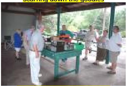
Loading up the auction table...