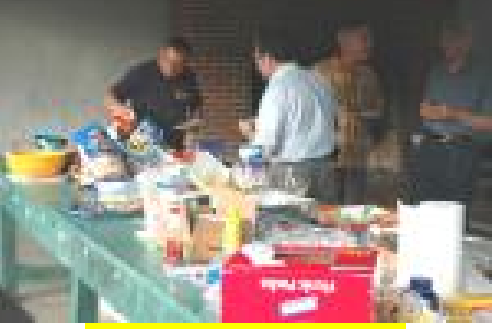
Scarfing down the goodies