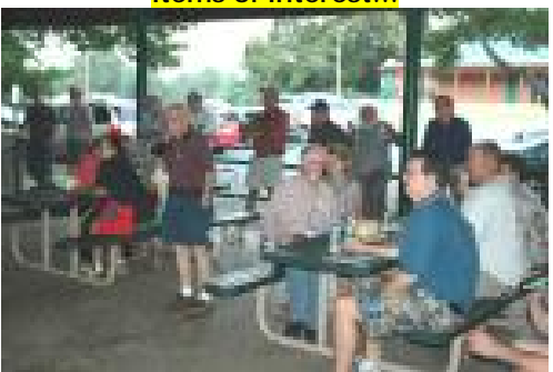
Bidding was intense!!!