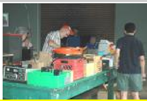
Checking out goodies at the auction table...