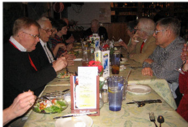
Many interesting discussions ensued...