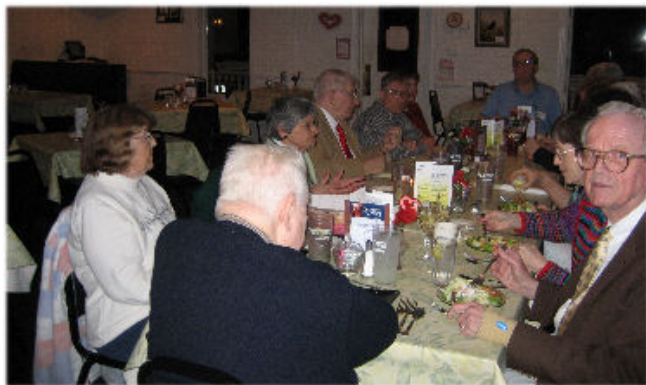
The view from the other end of the table...