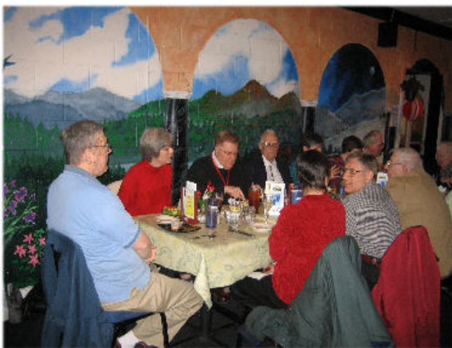
Enjoying great food with a colorful background of the Blue Ridge (you were expecting something different at the Blue Ridge Café???)