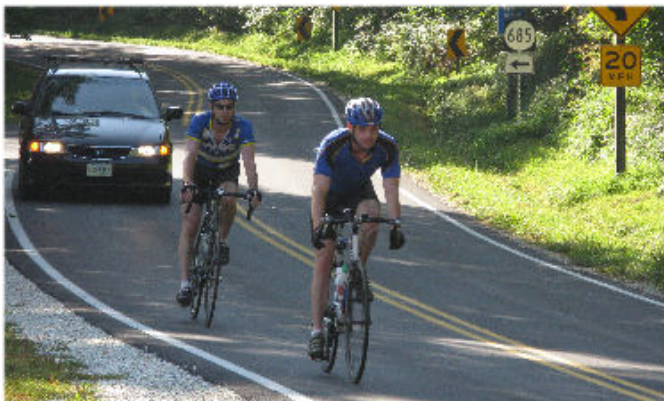
Cyclists with a shadow vehicle in the Blue Ridge Extreme Century Challenge race

That about wraps up the Public Service calendar for 2008 unless we are asked to provide help for anything that is out of our area. I have heard talk about a 100 mile – 24 hour run taking place in October, and the need for volunteers is large. More on that as I get further details.