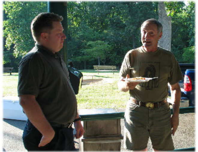
A perfect day for a picnic and catching up with old friends...