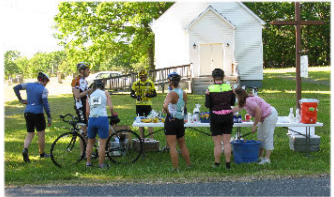
Taking a rest break at one of several rest stations