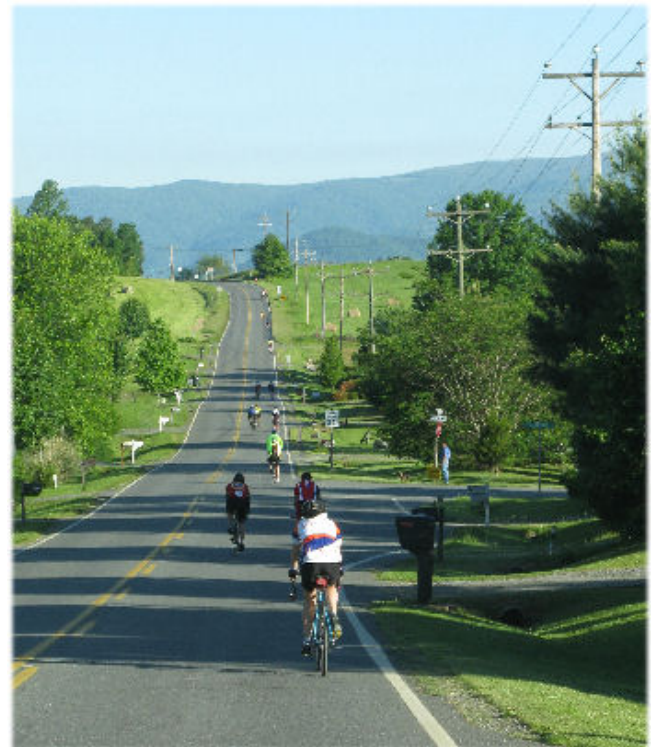
Wow --- what a beautiful day to be outside!