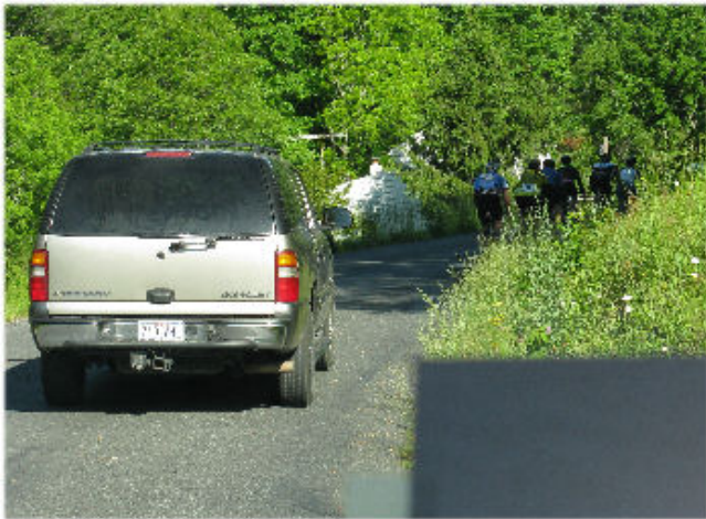
Shadowing the cyclists, just in case...