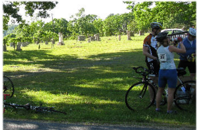
Enjoying a rest break and the scenic countryside