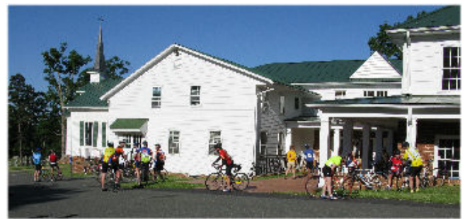
The cyclists are almost ready for the starting gun!

Here is but a small sampling of photos from the race: