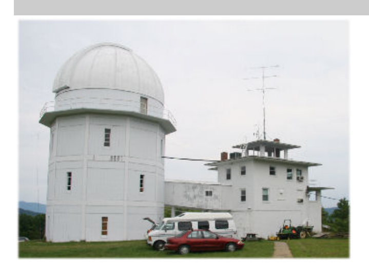
Our Field Day 2007 QTH at the UVA Observatories on Fan Mountain