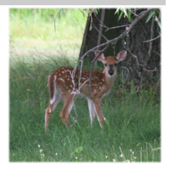
We also had several deer visit us quite often to see what Field Day is all about ...