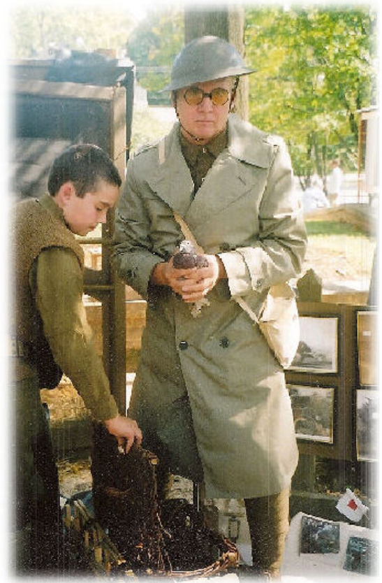
The pigeon decided not to fly to Richmond unless given a first-class upgrade...

the pigeon thought otherwise and refused to fly, much to the disappointment of the handler and the crowd. The Homing Pigeon is known to fly back to their home nest distances of 1500 miles. When this demonstration was conducted in 2005 the pigeon arrived in Richmond in an hour and a half. (...and you get disgusted with the Amateur Bands at times).