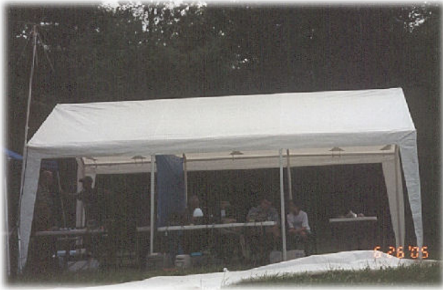
Mmmmmm... nice and shady here...