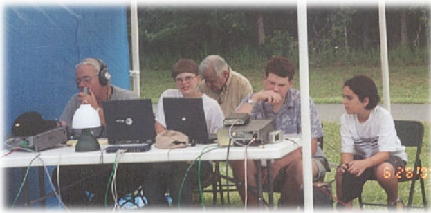
The bands are hopping!