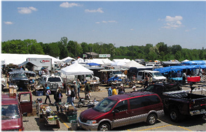
Just a small part of the **HUGE** outdoor flea market ..... and it's not raining, either!!!

booth selling Enigma machines! Wow! (No I did not bring one home.)