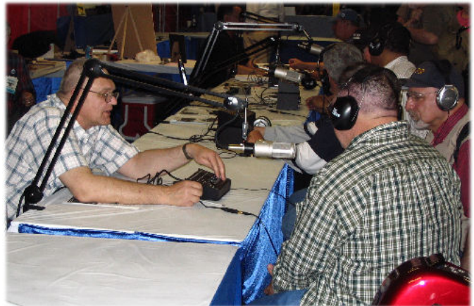
Learning how all the new equipment works!!

Dayton is the ultimate hamfest experience. I hope that you make it a point to go. Next years Hamvention® is May 19, 20 & 21. If you plan to go I suggest that you reserve accommodations before February 1, 2006. Hotels rooms fill up quickly. Who knows --- maybe the club will charter a bus and book a block of rooms and show up in force. Wouldn't that be swell!