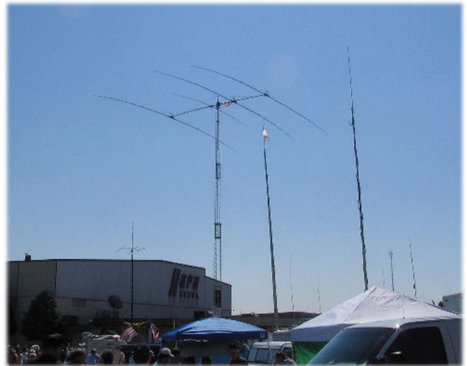
What hamfest would be complete without antennas? I'm sure most of us would like these in our back yard!!