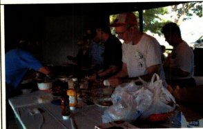
Everybody starts sampling the culinary delights...