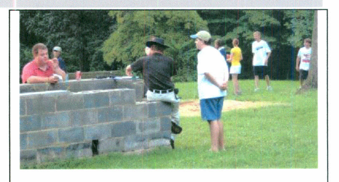
Well, will it be horseshoes, football or volleyball ??