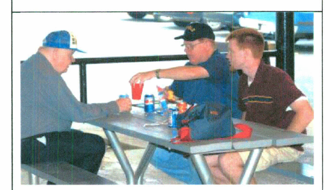
Time for refreshment...