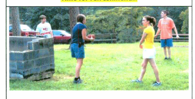
Anyone for a friendly game of football?