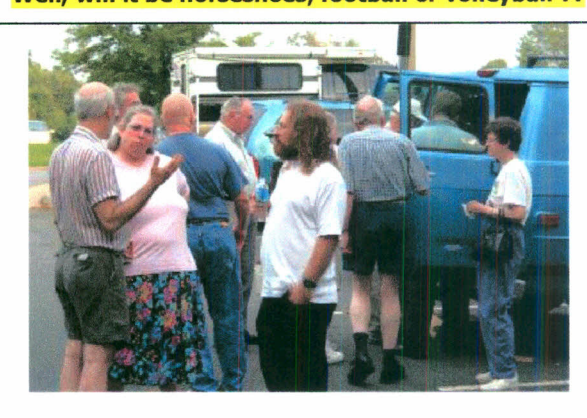
Eyeball QSO's at the tailgate hamfest!