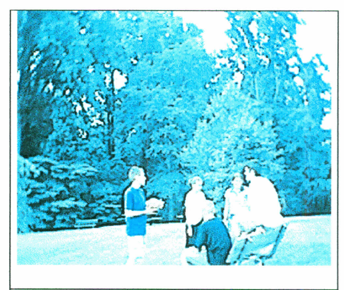
Planning the football game