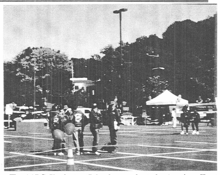
The AARC "brain trust" hard at work at the American Heart Association Walk, October 1996.