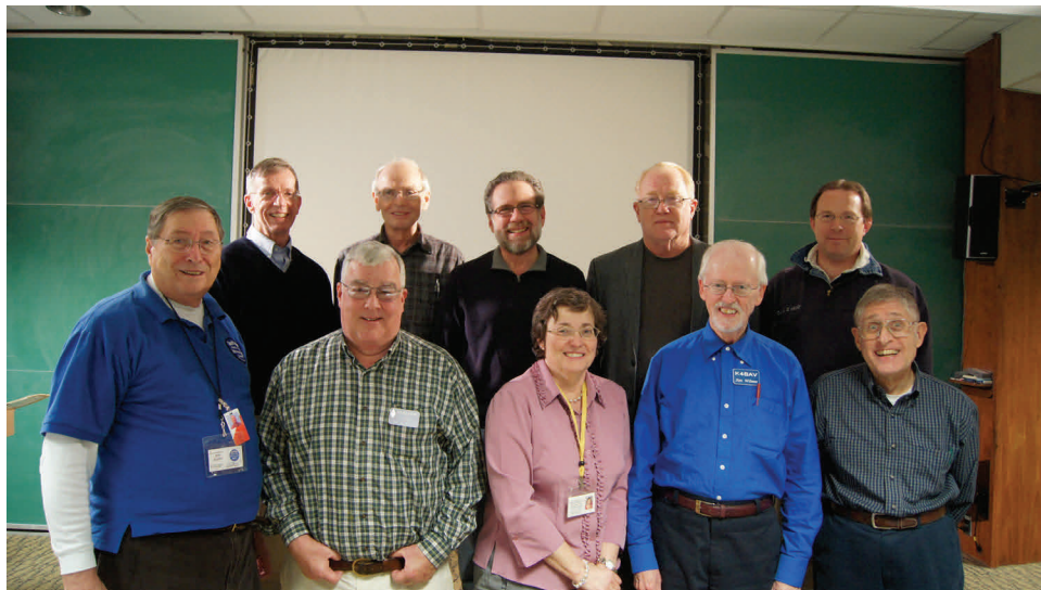
AARC Elected Leadership 2013