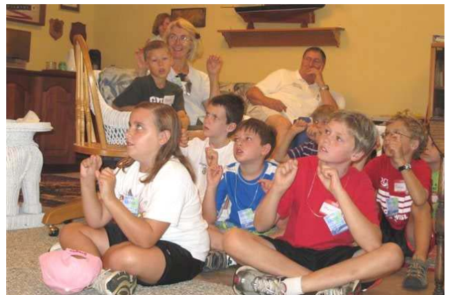
The campers act out the code with their hands to simulate the time length of a single dot to a dash.