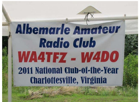
New AARC banner

The AARC operated Field Day 2011 at the Earlysville Fire Department again this year. Field day is arguably the ARRL's most popular operating event of the year, and definitely my favorite. Field day has something for every interest. Whether it's exercising your ideas for a new antenna type, trying out a new mode, honing your skills in CW, or digital, or just helping out by assisting others in erecting shelters, antennas, or any number of the myriad tasks necessary to erect 3 HF stations and a VHF station in a limited amount of time.