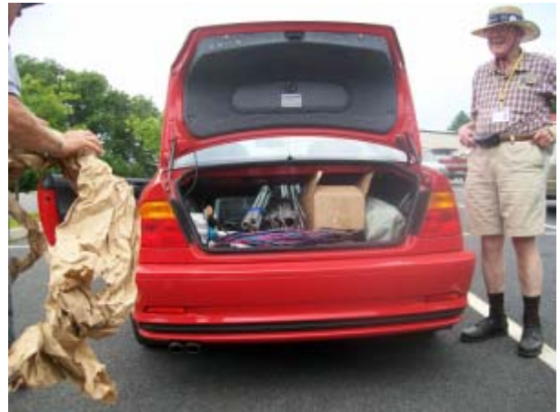
K8RVR was heard to remark "Holy !!!!. Is that some kind of clown car?"