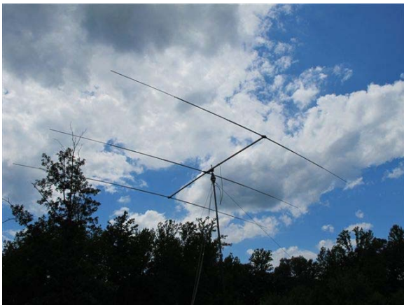
20M beam at its operating height of about 25 ft

By 5PM Friday most of the antenna work had been completed. Saturday morning, about 10AM, equipment installation was started. Generators were put in place and the shelter, mast and antenna for the 6m station was completed. Digital network was set up and after some problems looked to be working correctly. After a refreshing lunch it was time to get ready for the operating portion of field day.