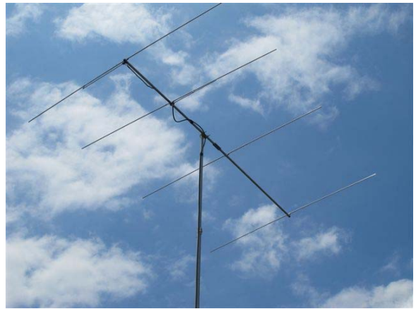
6M beam looks great against the sky