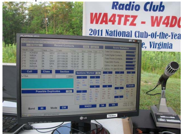
N3FJP logging software

The first 20 minutes or so went without a hitch and then the digital network decided to die. Trouble shooting proved that we had a problem that couldn't seem to be solved quickly so we went to single station logging. There was heavy activity on all bands and the different operators had a great time working all they could hear. Before the contest I had quickly installed a 10 and 15 meter dipole between two light standards just in case we needed to work other bands if the bands were open.