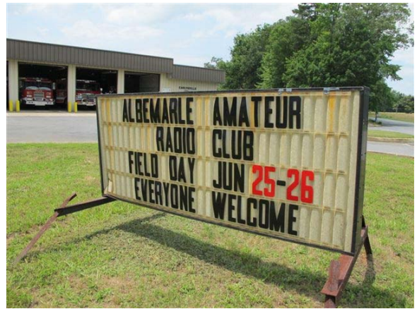
Earlysville Fire Station, Home to AARC FD

Field Day 2011. Perfect weather, good propagation, good friends, fellowship, opportunities to enhance your operating skills, good food, radios, fresh blackberries while putting up wire antennas, teamwork, these are just a few of the memories I have from Field Day 2011.