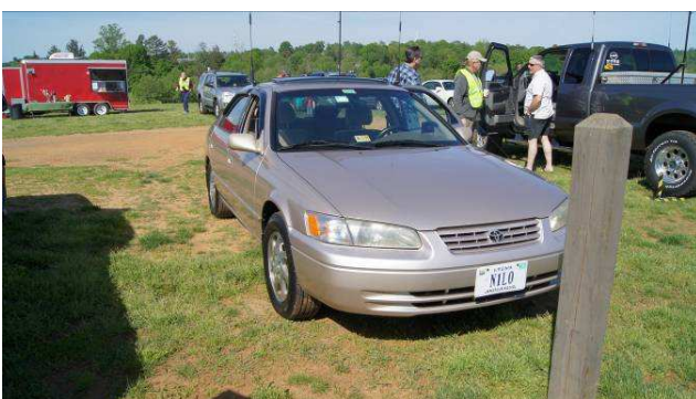
The winning car entry of N1LO of Fredericksburg, Va.