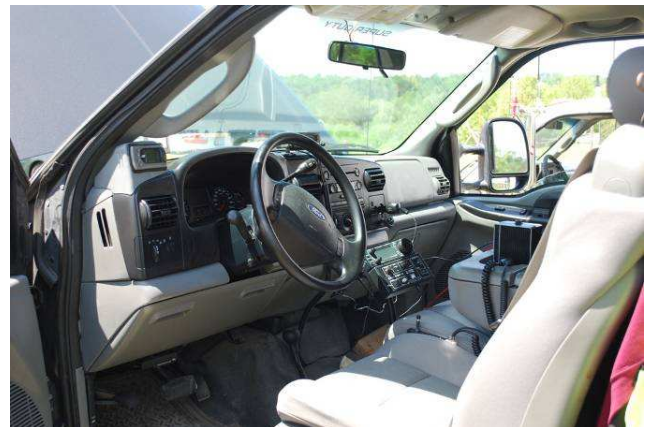
N1LO had an impressive mobile station in his car.