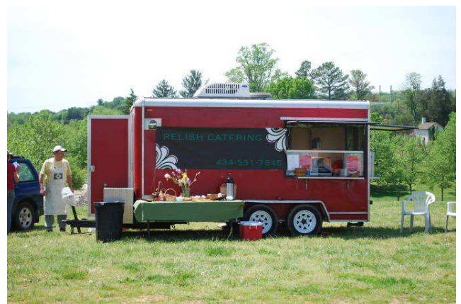
Relish Casual Catering provided great food throughout.