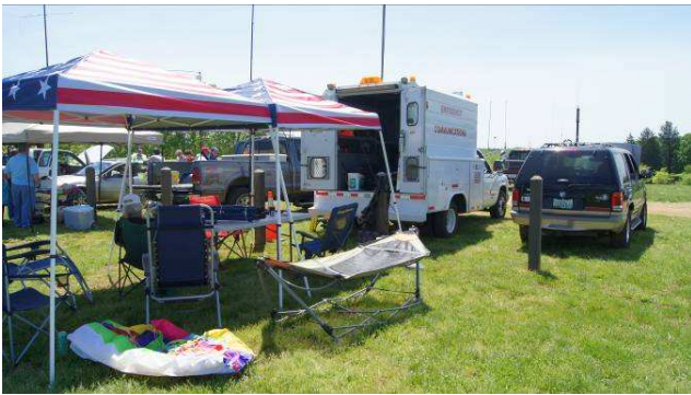
Prepared to spend the day with good food, fun & fellowship.