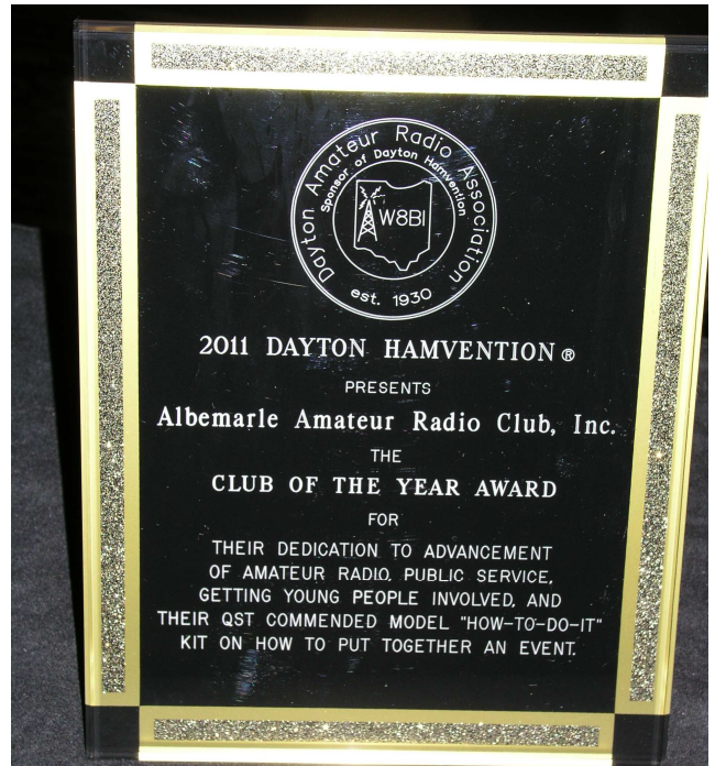
Check out the plaque the club received.