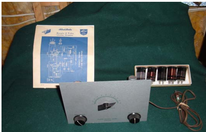
Early version (rare)

Many older hams/SWLs may have had one of the Knight Ocean Hoppers sets as their first radio back in the 50's or 60's. Some of you might even have made contacts with these. They are a lot of fun to play with and can provide several hours of enjoyment, but they are not serious amateur radios. As with all older tube gear, I'd recommend bringing these sets up on a variac, keeping the line voltage to 100-110 volts. There are 2 versions of the Ocean Hopper (OH). Each is covered briefly below.