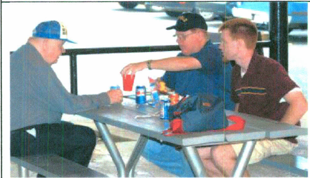
Time for refreshment...