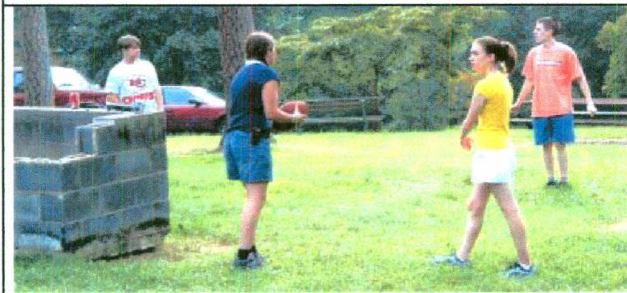
Anyone for a friendly game of football?