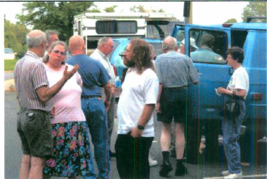
Eyeball QSO's at the tailgate hamfest!