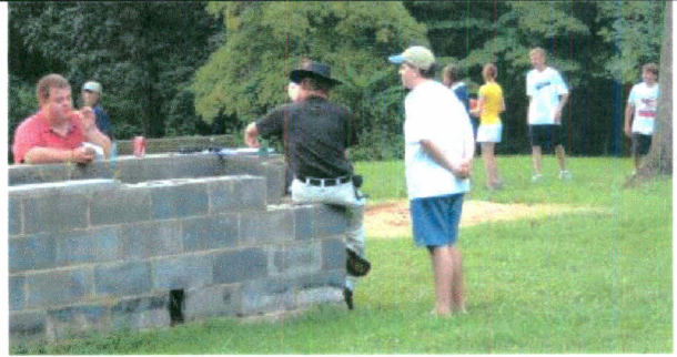
Well, will it be horseshoes, football or volleyball ??