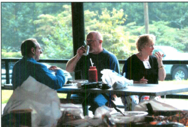
Good food and good company...