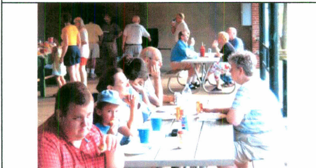
Everyone is happily enjoying the evening's fare...