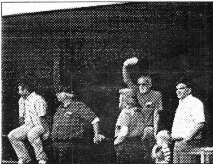
AARC PICNIC, SEPTEMBER, 1995